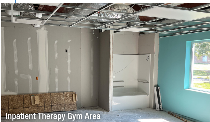
Inpatient Therapy Gym Area

Construction on the Specialty Clinic Area is proceeding smoothly, Price said, with interior walls and rooftop heating/cooling completed. Price said the ceiling grid has been installed with 95% of the overhead mechanical, electrical, and plumbing completed. "Construction is on track to be completed in mid to late September," Price said. "Culbertson providers will occupy the space sometime in early October." 🏡