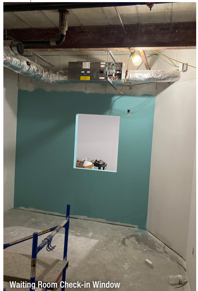
Waiting Room Check-in Window