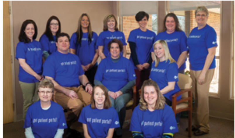
Our staff is ready to help you log in.

Patients can easily request and track appointments, as well as reschedule or cancel when necessary. Updates to personal information, like your address, phone number, insurance information and emergency contacts, can be made on the Portal as well.